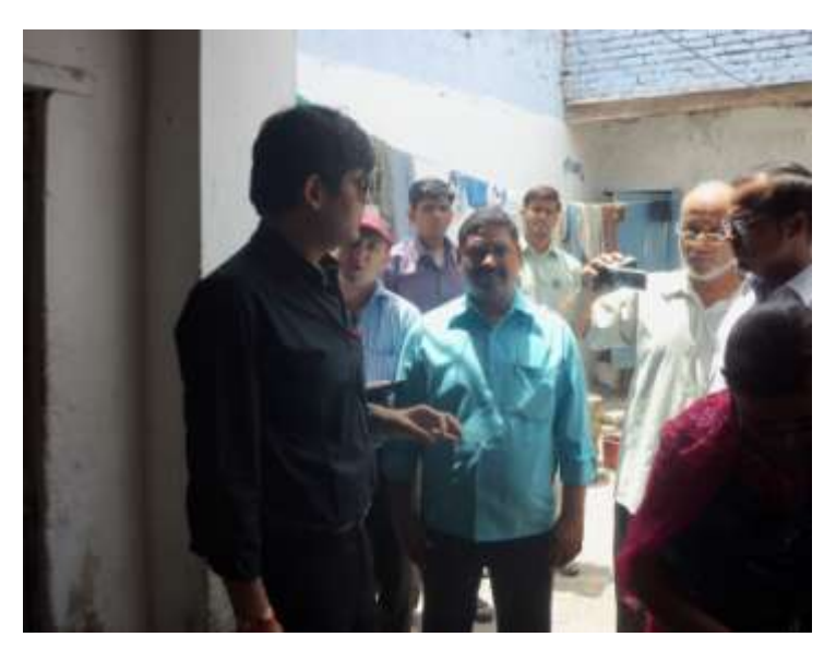
that the kitchen was

The infrastructure in the home was extremely lacking. The Home housed 35 children squeezed inside 3 small rooms, which had no windows or casements or any other provision for ventilation that which was direly needed with so many children being crowded together. The rooms of the