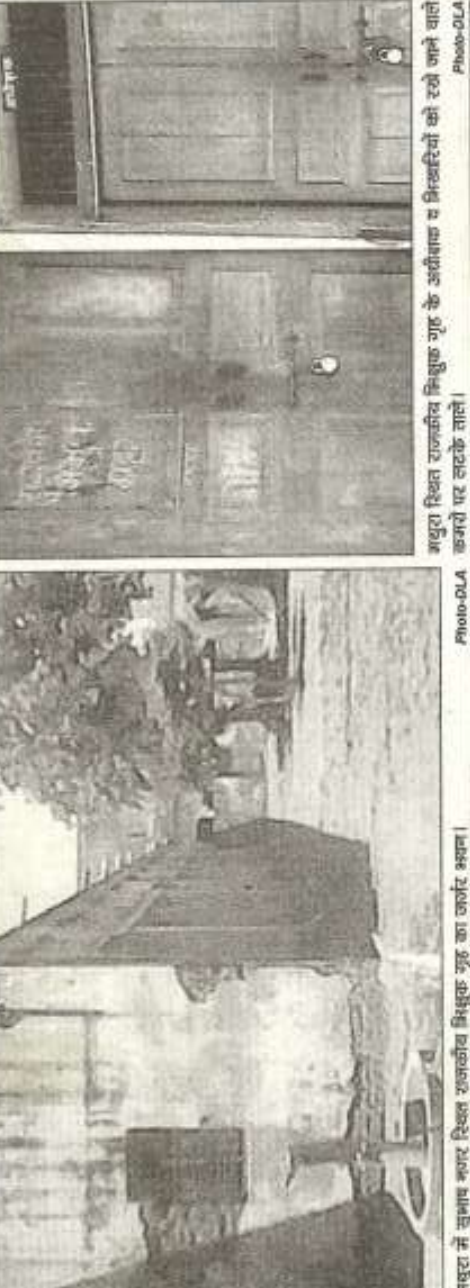
नबुरा में सुभाष नगर रिवल राजकीय भिक्षक जृह का जर्गर अधन।

पुनेडद्वार की व्यवस्था सरकार द्वाय है गई है लेकिन इस्तीकत कुछ और ही बच्चे कर रही है। इस इस्तीकत को आधिकतारिक तीर जनने के लिए क्वलिस्टी के हां, कुछ ऐसे हालात है सुपान त्यार में समान कल्याण विभाग द्वारा मंत्राहितत राजकीय भिष्कुक गृह कि। यहां महिसे के असम्बास और सड़क पर सिख मागने बाले निवासीयों को आस्वीनम् बनाने और उनके