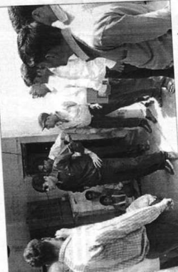
गाड़ीय वास्तर अधिकार संस्कृत अत्रोत के अध्यक संगंत कर्म मञ्जूत में शिल्ह गृह का निर्माक्षण करते हुए।